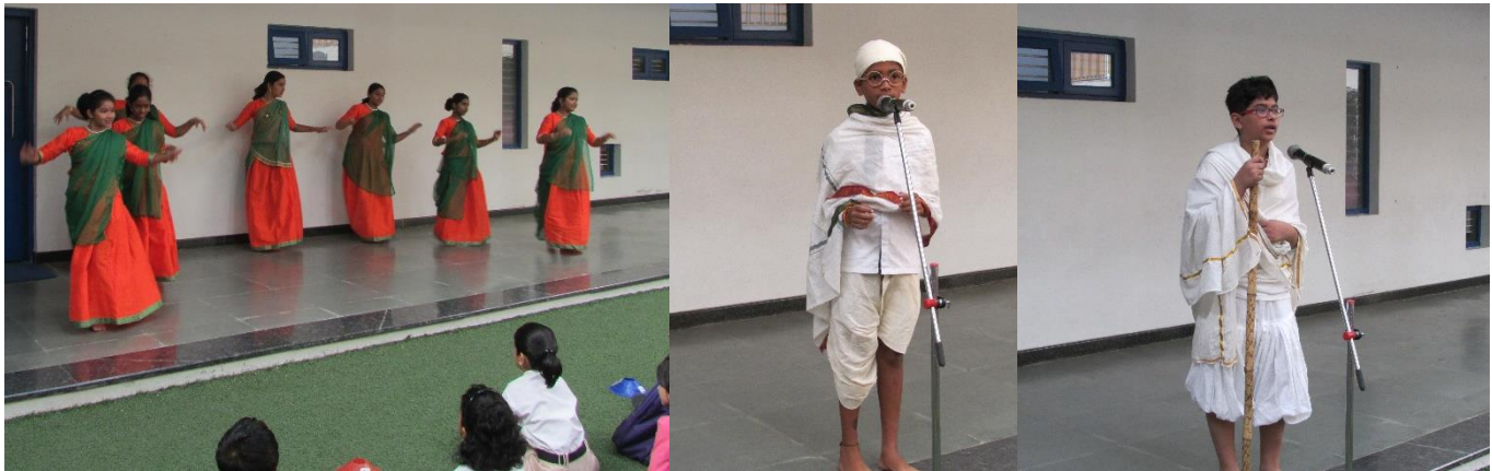
Kindergarten – Dussehra Celebration